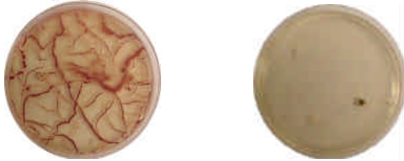
Before and after bacteria samples application of TOSII unit to commercial dumpster compactor